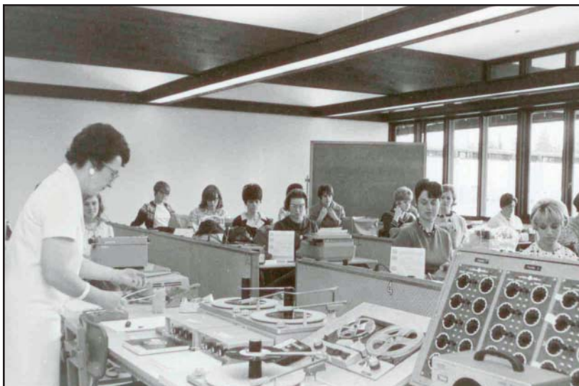
Secretarial class learning dictation, 1967.

Administrative Office Professional jobs are in high demand and exist in every type of business, industry, or