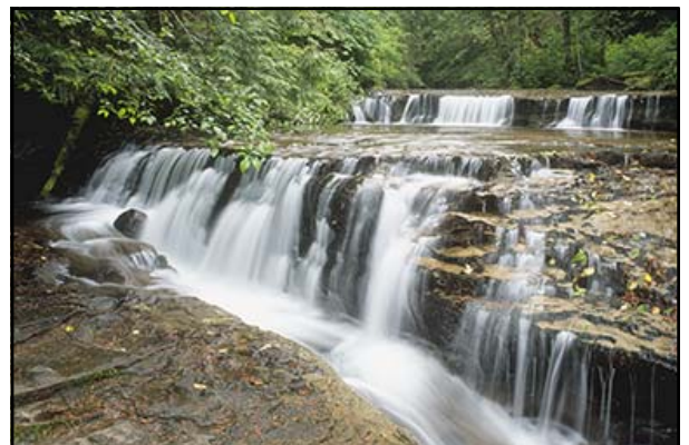
Prices/Information subject to change without notice

While a tripod is recommended for both days, if you have a pair of rubber boots today, you will find them useful for getting into the shallow water to get that shot that you may not otherwise be