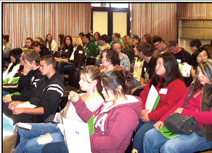
Talent Search students listen to a speaker during last year's campus visit to the University of Oregon. This year's first college field trip was earlier this month to Oregon State, with many Satellite schools heading back to the U of O on Thursday, October 30.

into consideration all college costs for the average student. This would include tuition, books, lab fees, rent, living expenses, food, entertainment, shampoo, etc. The point is that attending college is expensive. But it is an expense that is well worth the time, money, and effort because of the huge potential to increase lifelong income and enjoy a higher lifestyle.