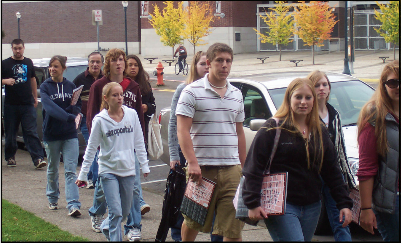
Talent Search juniors and seniors walk to lunch during their visit to Oregon State University last year.