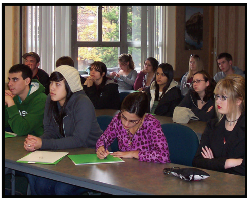
Students listen to a speaker during a breakout session at the U of O campus visit.